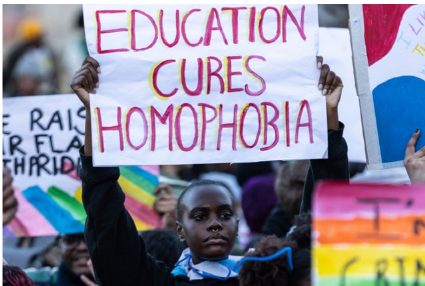
Students at UCT protested on campus

Section27 is a public interest law center that seeks to achieve substantive equality and social justice in South Africa. Section27 uses law, advocacy, legal literacy, research and community mobilization to achieve access to healthcare services and basic education. Section27 aims to achieve structural change and accountability to ensure the dignity and equality of everyone. section27.org.za