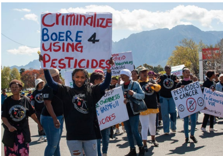
Farm women marched in Worcester in the Western Cape against the use of harmful pesticides.

Pathways mission is to catalyze, educate, train, support, enable and accompany self-organized movements standing for social justice. Supporting movements in connecting their immediate struggles, here-and-now reforms with the long-term agenda for transformative structural change