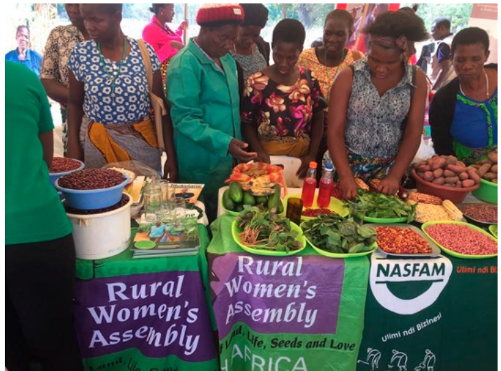
Women farmers display at the Rural Women's Assembly

Equal Education (EE) is a social movement led by students, educators and activists to address inequality in the South African education system. EE engages in evidence-based activism, ensuring students have textbooks, sanitation, safe