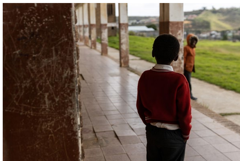
Seven million children (44%) in South Africa remain below the food poverty line.

Ntingani Loocha is a holistic intervention that combines the development of rural youth as agents and leaders of socio-economic change, grassroots activism and civic engagement. The program works to mentor youth with the aim of achieving socio-economic change through local economic alternatives and the realization of constitutional rights and democracy building initiatives.