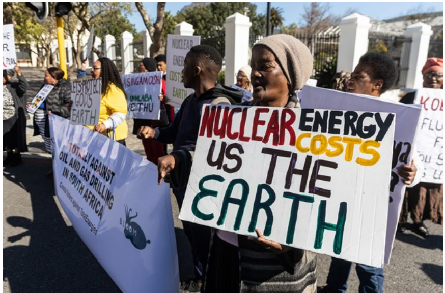
Protest outside Parliament in Cape Town against offshore oil and gas exploration.

The Unemployed People's Movement (UPM) advocates for change for the jobless, addresses food sovereignty and the climate crisis affecting the poor. In 2021, UPM won an unprecedented case dissolving the Makana Local Municipality after years of not meeting the basic needs of residents due to corruption. UPM continues to challenge issues of unemployment, poor-quality housing, lack of water and sanitation, lack of electricity and street lighting, and violence against women.