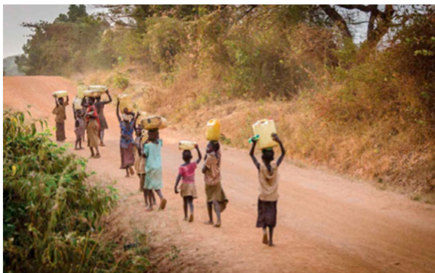
Eastern Cape Water Crisis

The Treatment Action Campaign (TAC) was founded to fight for access to AIDS treatment. TAC's campaigns were instrumental in securing a universal government-provided AIDS treatment program, which has since become the world's largest with almost five-million South Africans now on treatment. TAC continues to play a national role in policy development, monitoring of government health services, educating communities and advocating for people with HIV/AIDS and TB. tac.org.za