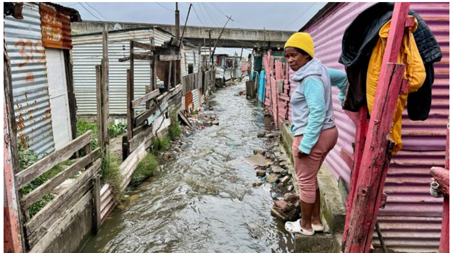
Siyahlala informal settlement after a flood.

GroundUp's inception in 2012, created a non-profit media organization focused on community journalism, reporting stories in line with the constitutional rights of housing, education, health, safety, a decent environment, justice, food and dignity. Dedicated to publishing news that matters across South Africa. groundup.org.za