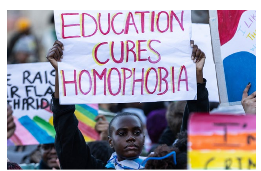
groundWork, Pietermaritzburg, South Africa

Ground Up's inception in 2012, created a non-profit media organization focused on community journalism, reporting stories in line with the constitutional rights of housing, education, health, safety, a decent environment, justice, food and dignity. Dedicated to publishing news that matters across South Africa. groundup.org.za